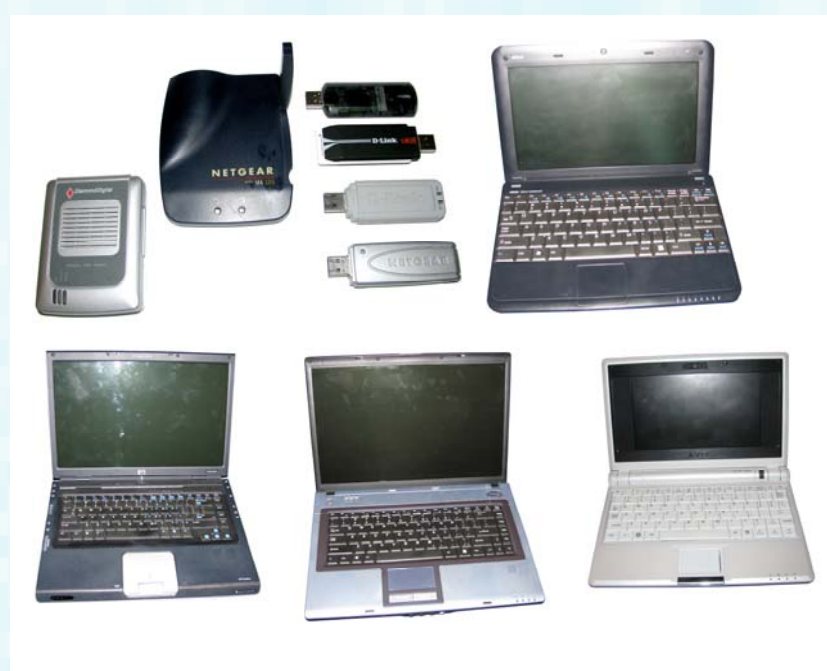
Figure 1. Some of the devices used in testing