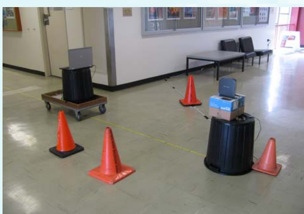
Figure 2. Indoor Testing