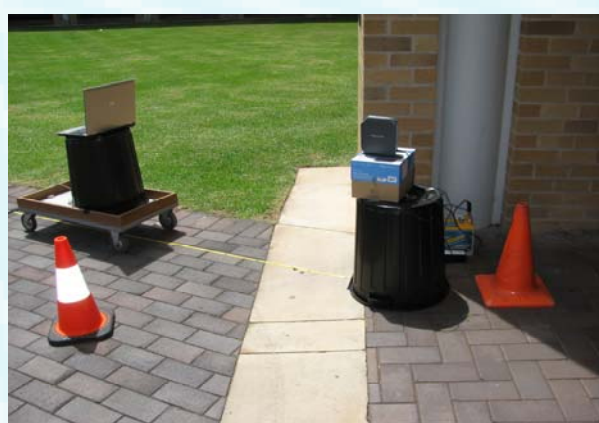
Figure 3. Outdoor Testing